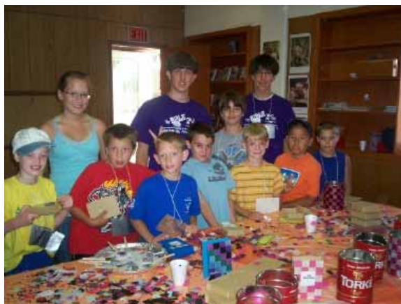
Red Lake Servant Event 2007