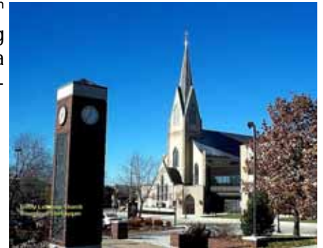
Divine Services: Sunday 8am, 10:45am Mondays at 6pm