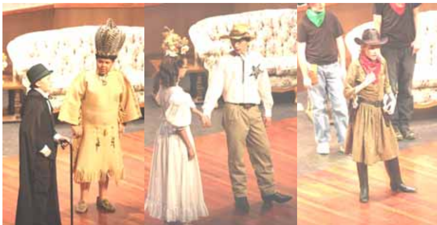
Scenes from the Trinity Lutheran School Musical: “Rogue of the Railway”