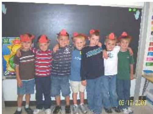
First Graders learn about fire safety

The complete choir schedule for the entire year can be downloaded on our website at: www.trinitysheboygan.org/pdf/choirschedule.pdf .