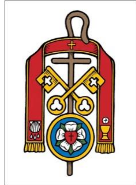
“Jesus Authorized Them”

Morning Meditations WHBL 1330am 7:26am & 10:45am St. Paul - Sheboygan