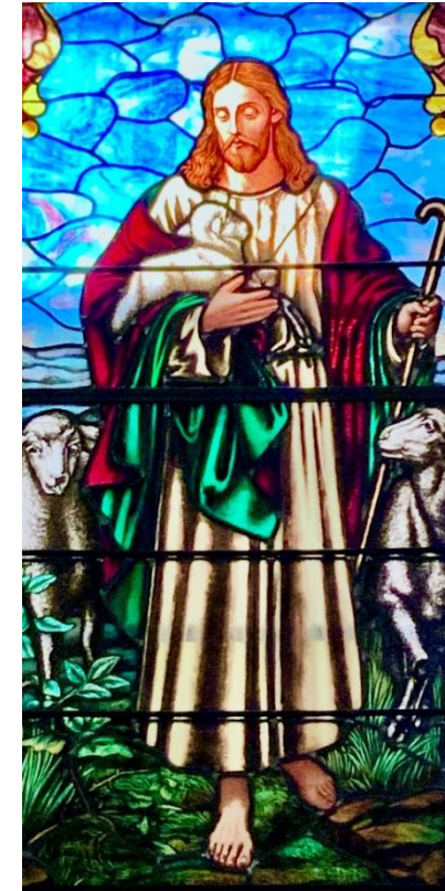
“Safe in the Shepherd’s Hands”